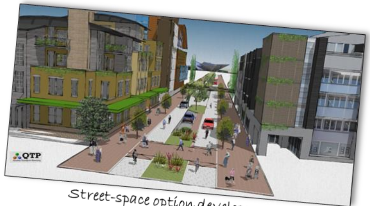
Street-space option development